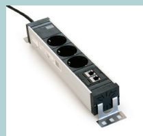
Power socket blocks