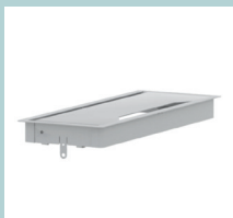
Metal grommet: 317x119 mm, H=27 mm