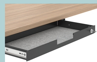
Felt-lined metal drawers with lock