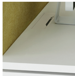
Desktops with a cut-out for grommet and wire management