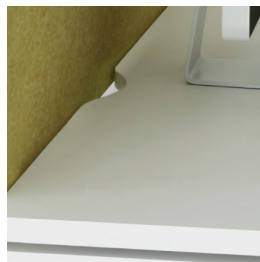
Desktops with a scallop for wire management