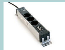
Power socket blocks