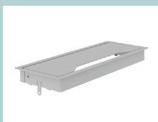
Metal grommet: 317x119 mm, H=27 mm