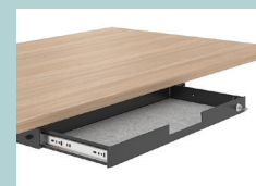
Felt-lined metal drawers with lock