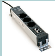
Power socket blocks