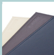
Leather table mats