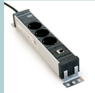
Power socket blocks