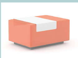
Metal table placed on the pouf (black or white colour)