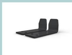
Linking parts (2 pcs.)