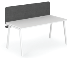
ACTIVE, EASY, T-EASY, ONE, NOVA A