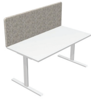
ACTIVE, EASY, T-EASY, ONE, ONE H, NOVA U / H / A / O, AIR, OPTIMA C, OPTIMA PLUS