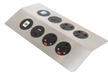
THOLUS - THL-2 RRP £1587

Boardroom table tops with the suffix '-CO' are supplied with rectangular cutouts 272mm x 132mm routed into the tops in a central position on the Enable range of worktables, suitable for the above power modules. See pages 173-175 for more information.