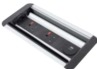
ECLIPSE - ENDD1 RRP £538