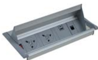
AERO - APD2PINF/1S/1D/1T-K RRP £310