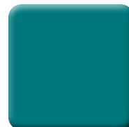
Dark Cyan (DC)