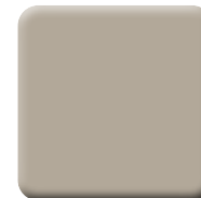
Stone Grey (SG)