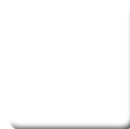
Alpine White (W)

We use Parapan 4mm solid acrylic panels on all of our reception counters. Parapan is the finest quality high gloss solid acrylic on the market and the high gloss finish is on both sides of the material. Parapan acrylic is highly durable, moisture resistant and UV stable, so it will not fade. Available in the following colours as standard (other colours available upon request).