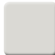
Light Grey (LG)