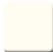
Cream White (CW)