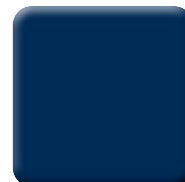
Royal Blue (RB)